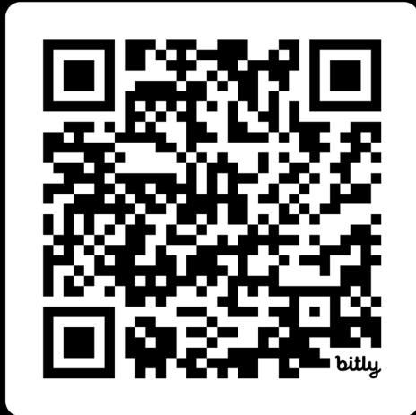
RUDIN LAW NEW ORLEANS