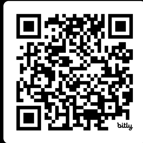
RUDIN LAW METAIRIE